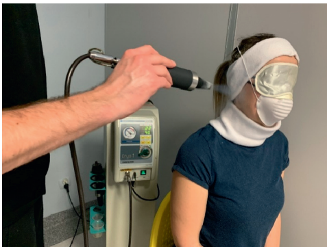
FIGURE 2: Local cryotherapy procedure in the TMJ area (author's photo).

values before and after the therapy. In addition, McNemar's chi-square test was used to analyse the nominal data. The results were considered statistically significant at p < 0.05 . For calculations, R package was selected.